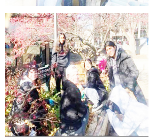
WIFI Leo Club Members are sponsored by Ann Arbor Host Lions Club